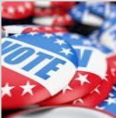
Board Members to remain the same for 2024