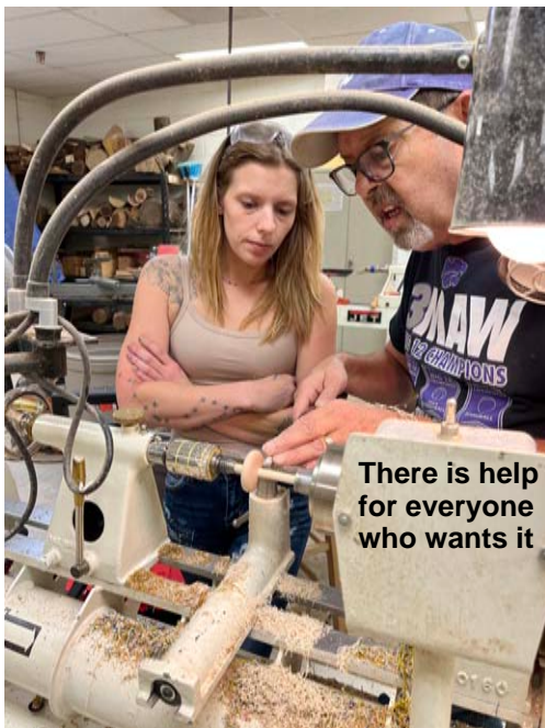
There is help for everyone who wants it