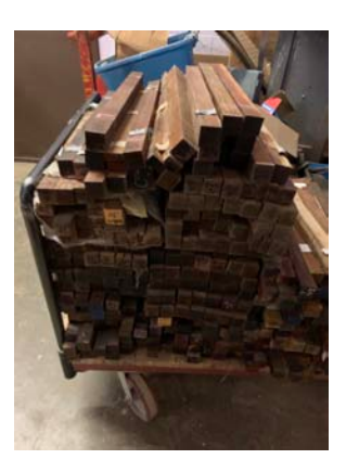
This wood is PERFECT for woodturners