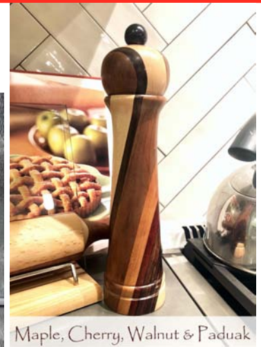
Maple, Cherry, Walnut & Paduak