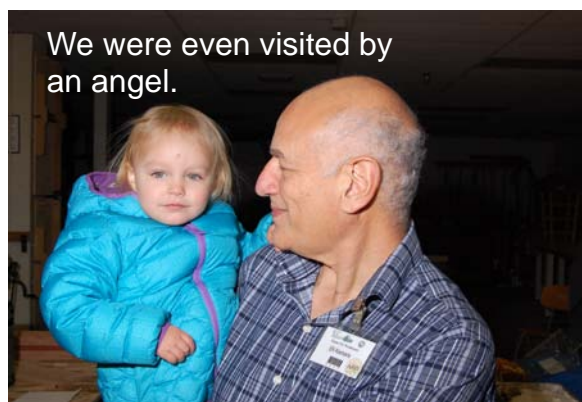
We were even visited by an angel.