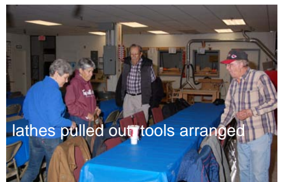
lathes pulled out tools arranged