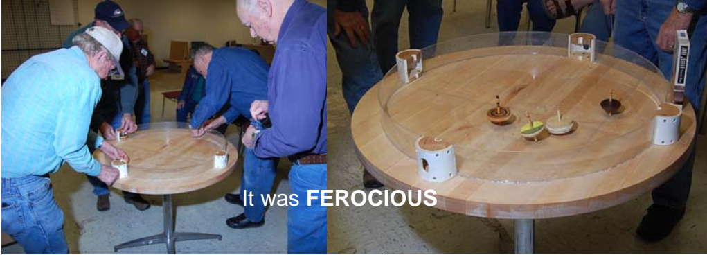
It was FEROCIOUS