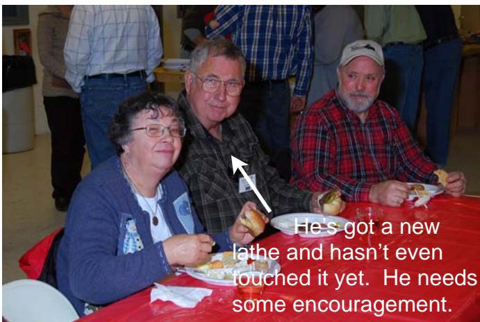
He's got a new lathe and hasn't even touched it yet. He needs some encouragement.