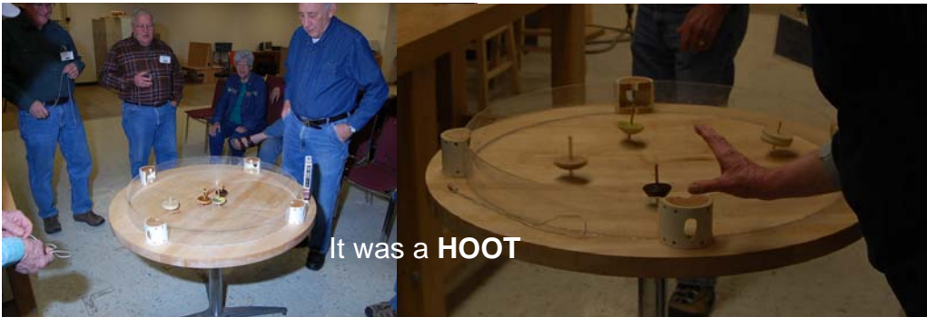
It was a HOOT