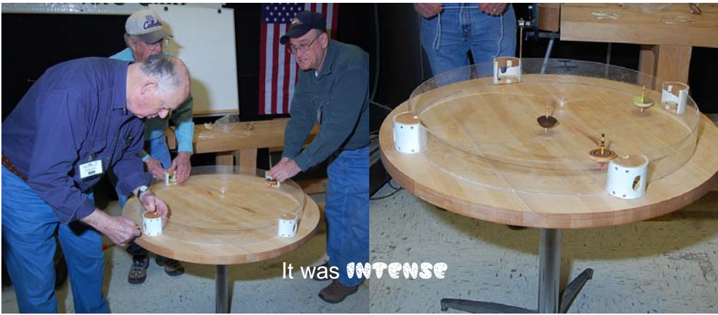
It was INTENSE